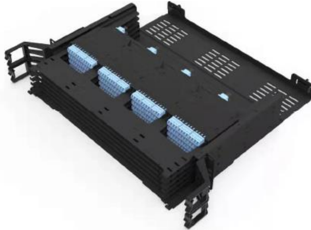
Figure 1. Giganet 2U 24 slots UHD Modular Sliding Patch Panel

Easy front access with hinged cable management bar which provides protection of the patch cords as well as labelling. Sliding patch panel is supplied unloaded and the cassette modules are supplied separately.